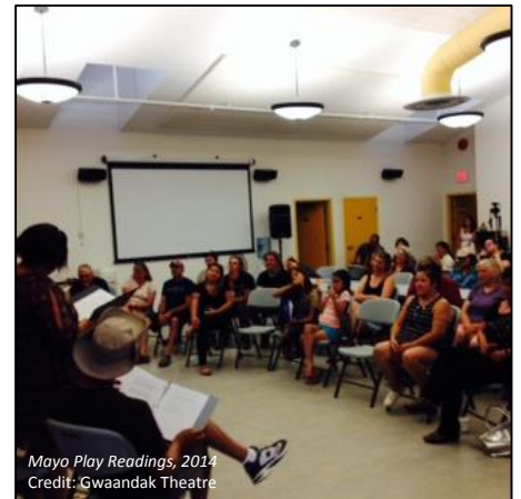
Mayo Play Readings, 2014