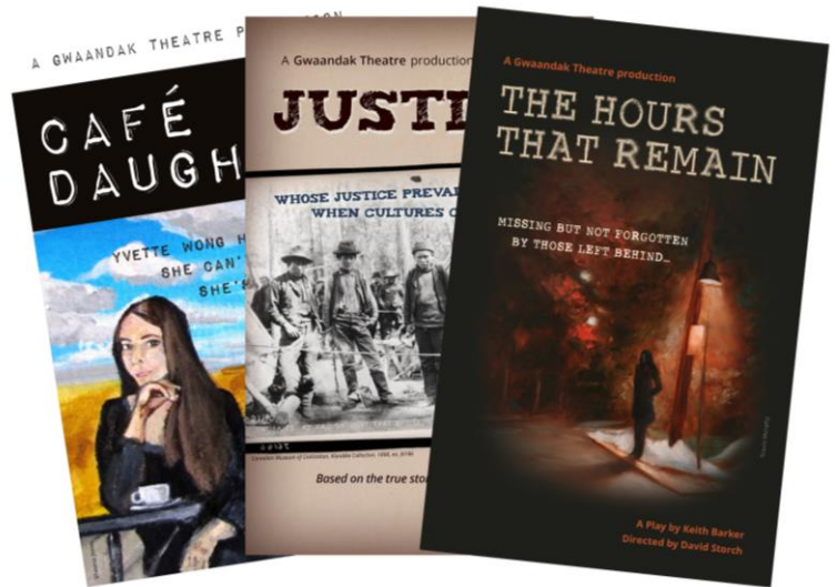
Touring Booklets